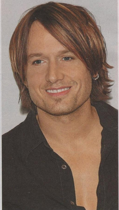
TRENT WILLMON ; KEITH URBAN

My long-term goal, obviously, is more personal as far as family. Careerwise, I think I'd like to get to the point where I can tour when I want to tour, not when I have to.